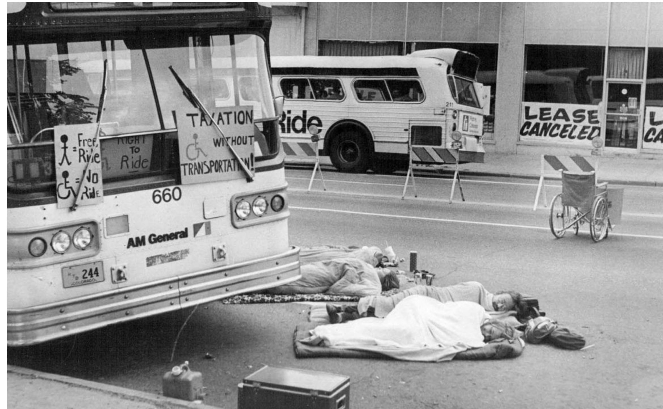
Members of the Gang of 19 protesting inaccessible RTD buses on July 1978 in Denver.