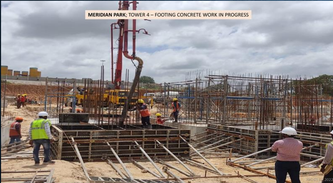
MERIDIAN PARK; TOWER 4 – FOOTING CONCRETE WORK IN PROGRESS