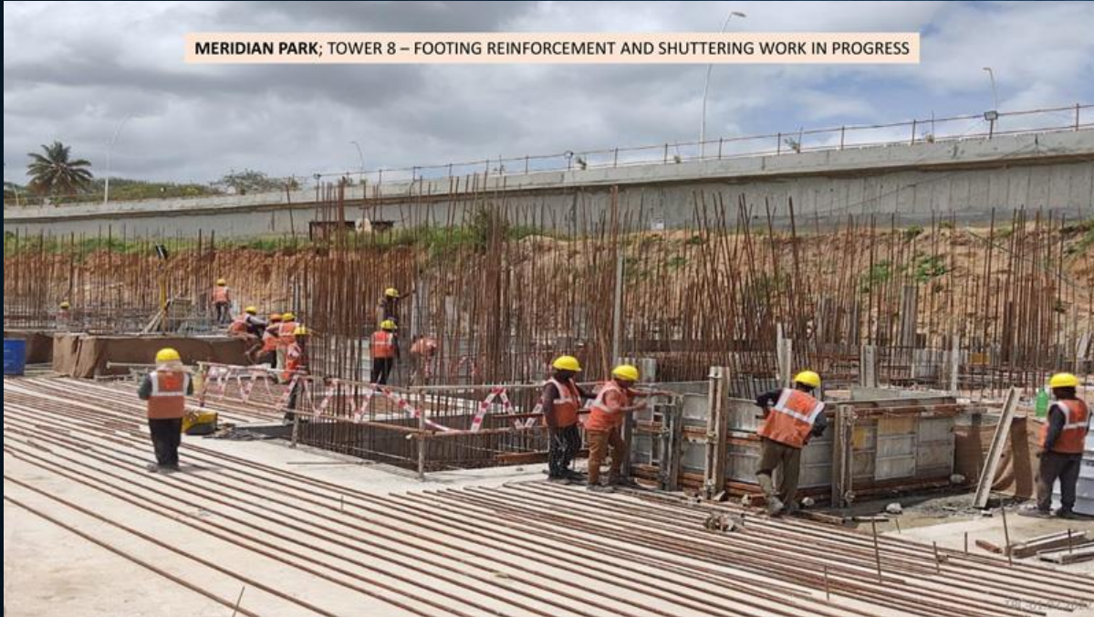
MERIDIAN PARK; TOWER 8 – FOOTING REINFORCEMENT AND SHUTTERING WORK IN PROGRESS