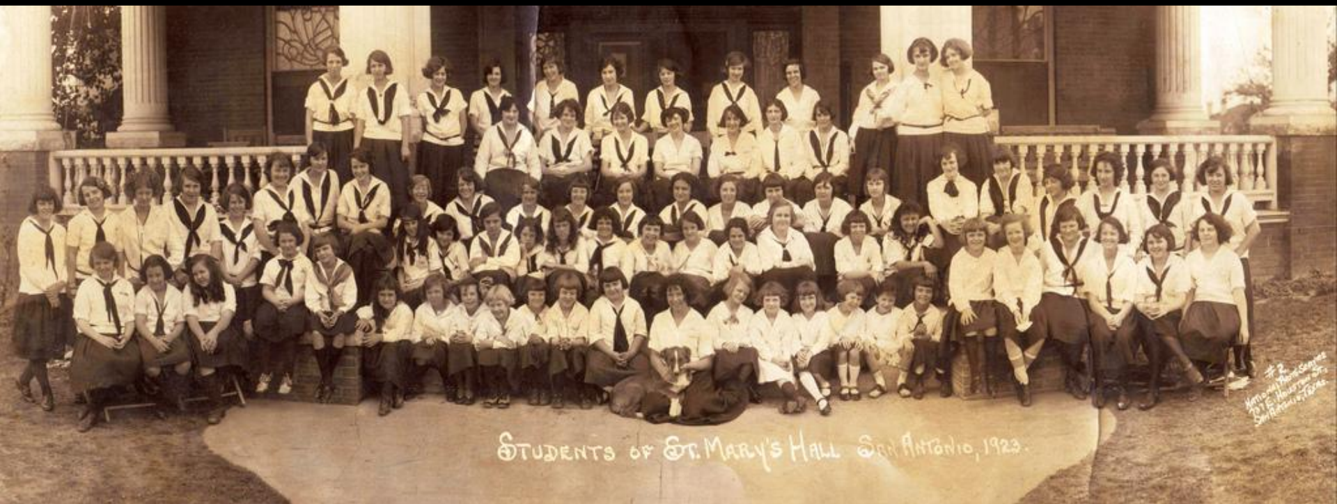
STUDENTS OF ST. MARY'S HALL SAN ANTONIO, 1923.

#2 National Honor Society St. Mary's Hall San Antonio, Texas