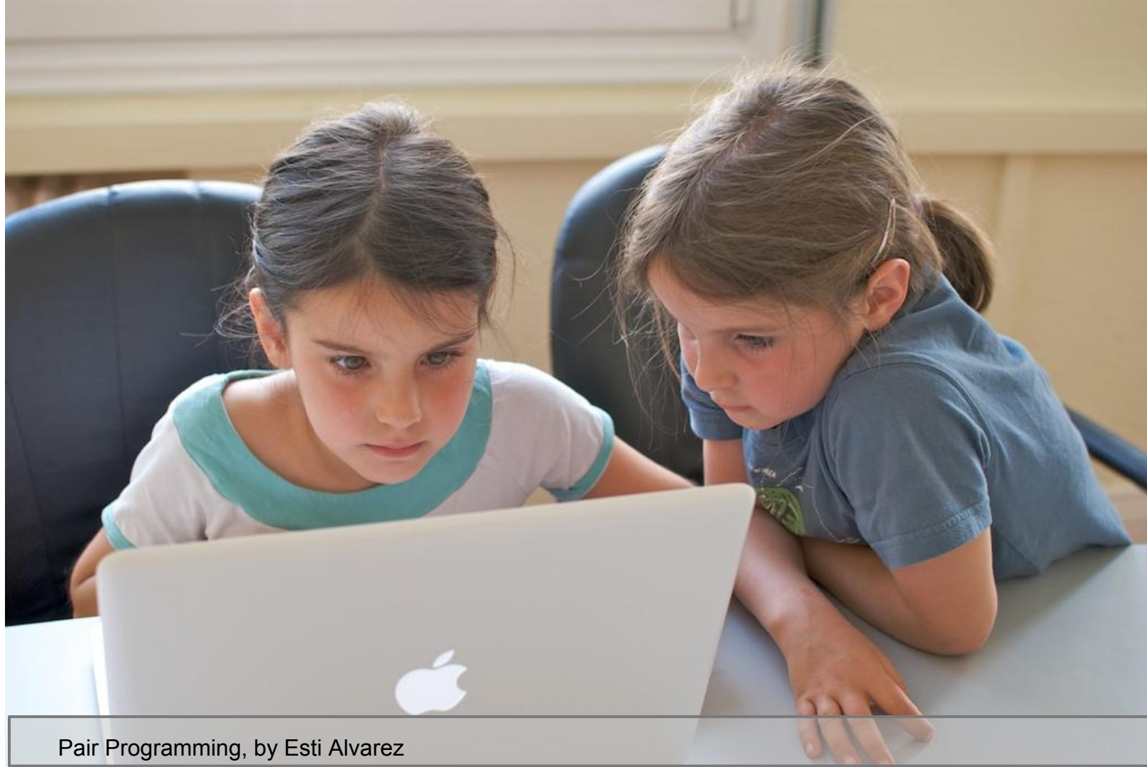
Pair Programming