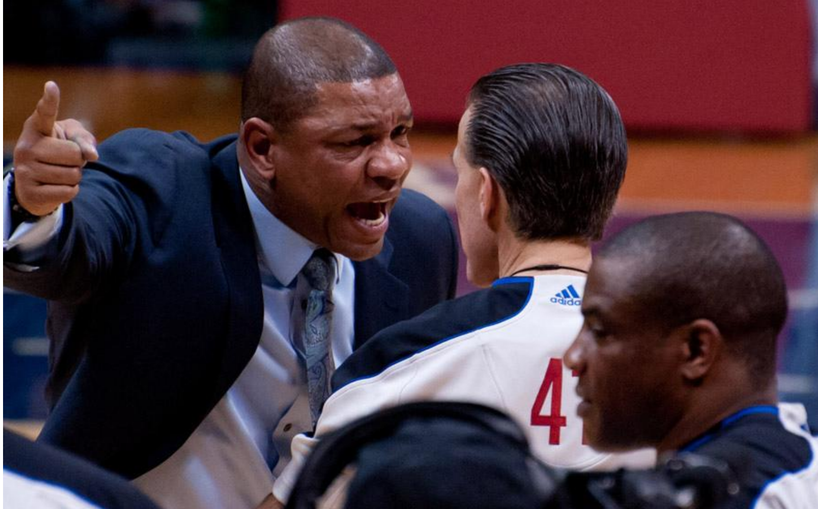
Doc Rivers | Boston Celtics