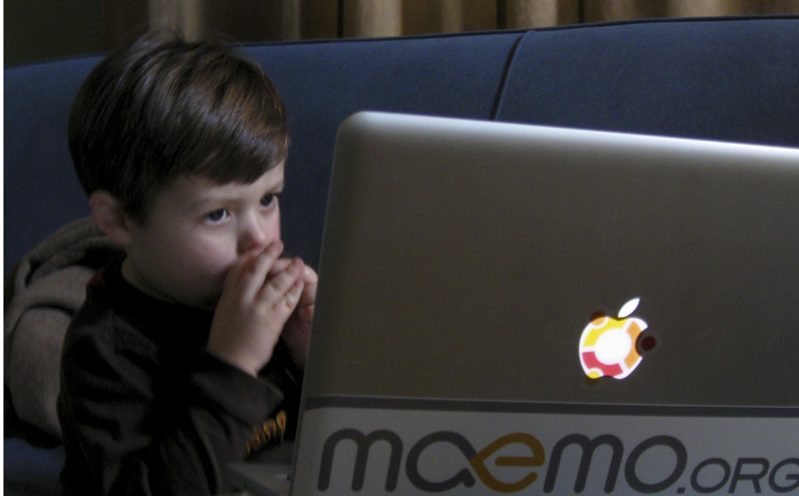
Future Developer