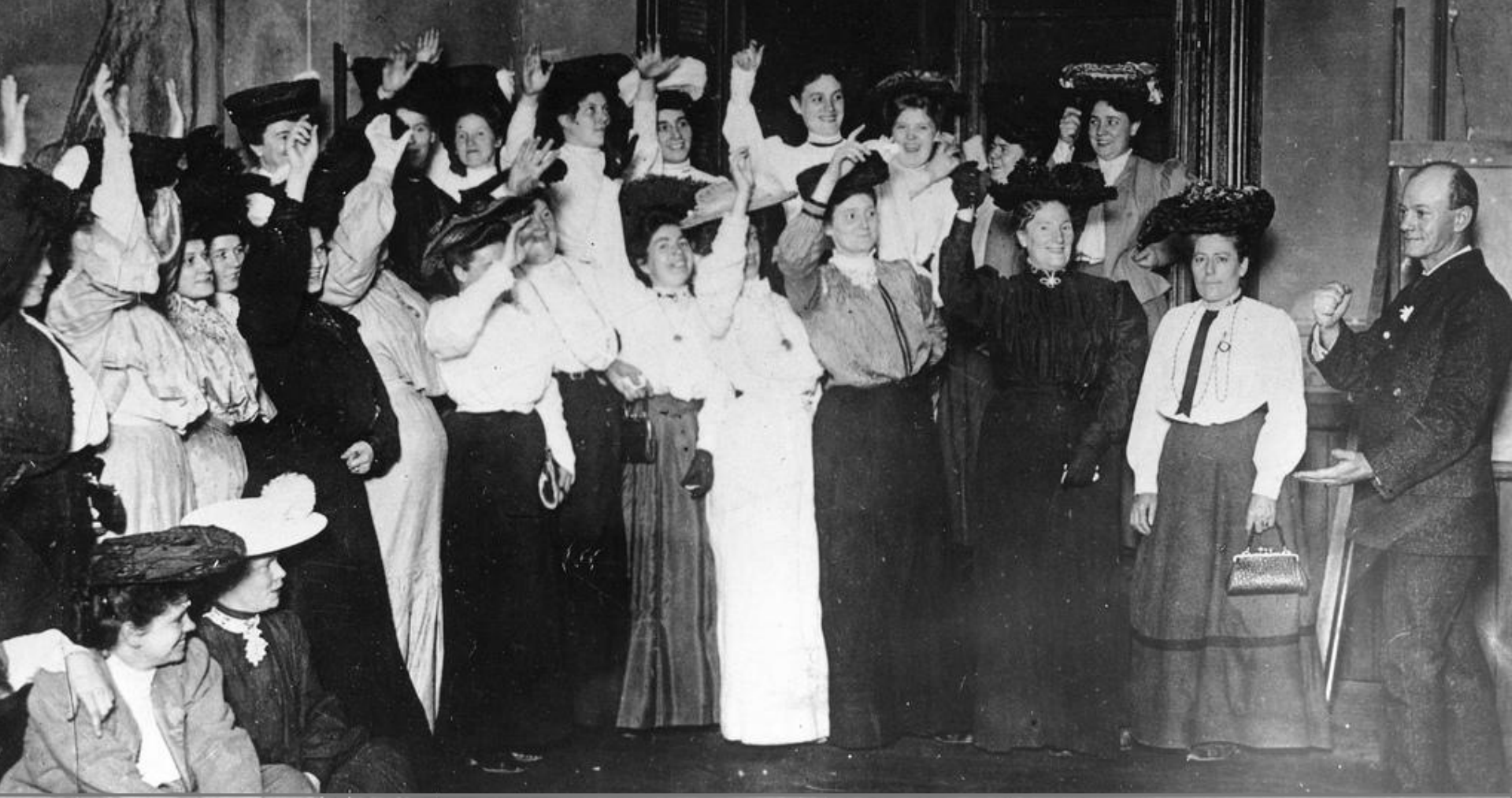
A group of women raise hands to volunteer for picket duty during the Shirtwaist strike of 09-1910, photo by Kheel Center