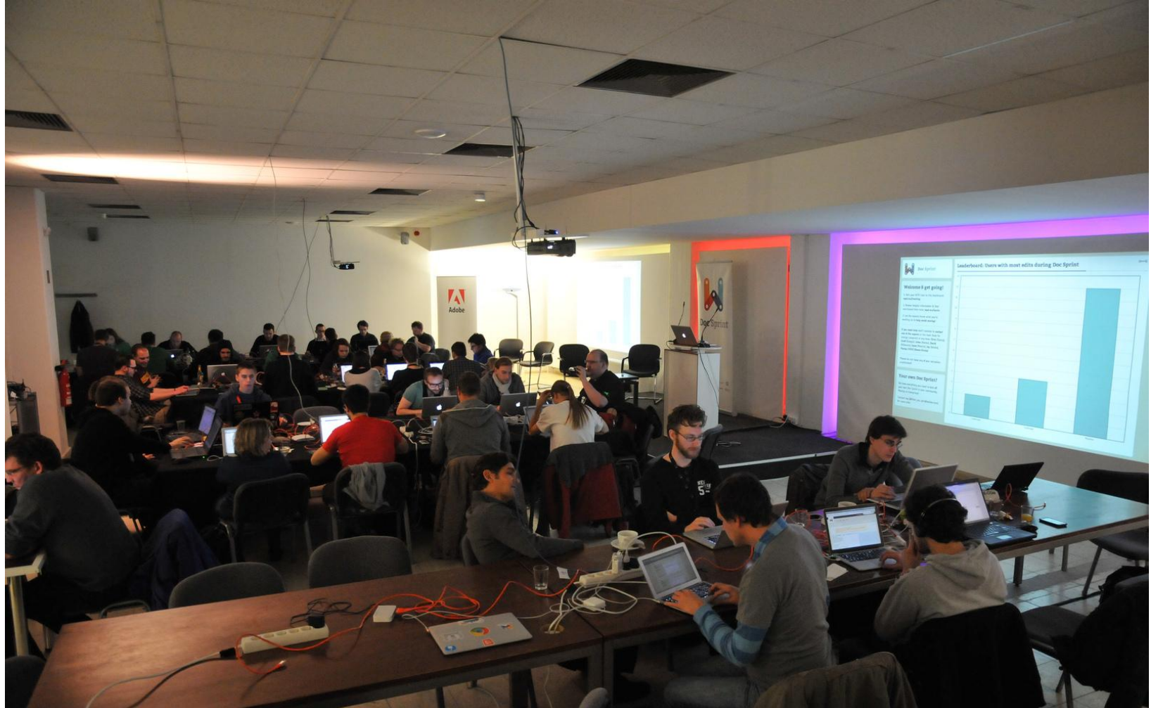
Web Platform Doc Sprint Berlin