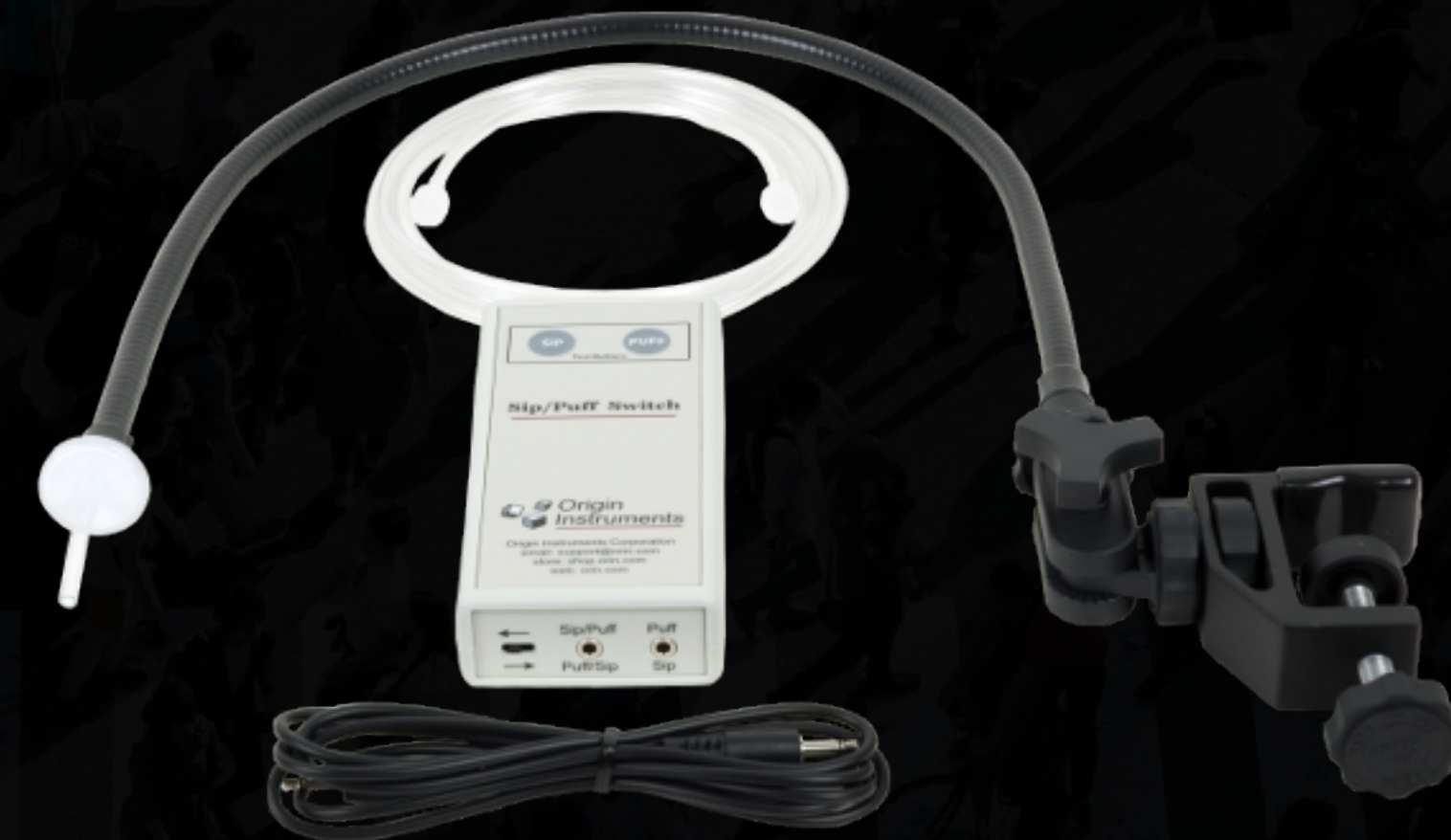
Sip n' Puff Machine