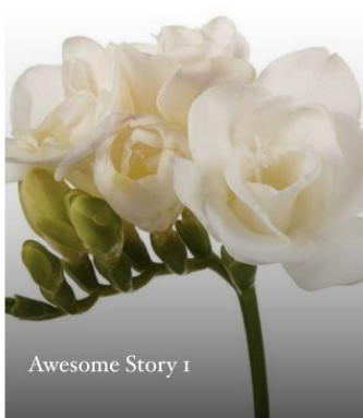
Awesome Story 1

Lorem ipsum dolor sit amet, consectetur adipiscing elit. Curabitur ultricies nulla ligula, a rutrum ligula sodales ac. Donec consectetur augue purus, sed interdum elit tincidunt ac. Etiam est diam, molestie eget ipsum et, laoreet maximus risus. Aliquam sed purus ultrices, fringilla ipsum sollicitudin, sollicitudin sem. Fusce in tincidunt ipsum, ut aliquam orci. Nunc tempor, nibh id viverra egestas, turpis tellus tincidunt libero, vel laoreet nunc metus quis lectus. Nullam mollis maximus nibh, et volutpat tortor sodales quis. Class aptent taciti sociosqu ad litora torquent per conubia nostra, per inceptos himenaeos. Proin lectus arcu, pretium id justo sed, convallis imperdiet tellus. Maecenas volutpat varius ornare. Mauris sit amet fermentum tellus, sed gravida dui. Donec ex eros, gravida a malesuada eu, convallis non lorem. Etiam vestibulum nibh in aliquet consequat.